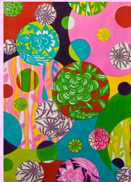
A design from the new collection "ZANZABELLE".

Visit Alexander Henry Fabrics on the web at: www.ahfabrics.com