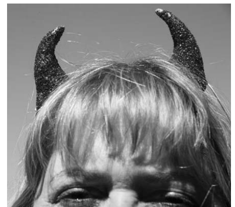
Finished horns are ready to go-go!

Measure an equal amount of clay for each horn. By hand, roll clay into 2 balls, then form into cones. Make the ends pointy and bend them in, forming horns. Stand horns upon the flat ends, then insert a toothpick through each base, to allow for the elastic cord (this is what keeps them on your head!). Allow horns to dry for 2-3 days. After they're set (about 1 day), rotate the toothpicks daily. Pour glue into a dish. Holding the horn by the toothpick, paint the horn with glue, then dip it into glitter. Let dry, and then add another coat of glue and glitter to make sure the horn is extra sparkly. Once drying is complete, remove toothpicks. Thread a darning needle with enough elastic to go around your head. Insert threaded needle into horns, pull the elastic through, and tie off the ends. This project was created by The Devil-Ettes -"San Francisco's Go-Go Sweethearts"! Check them out at: devilettes.com