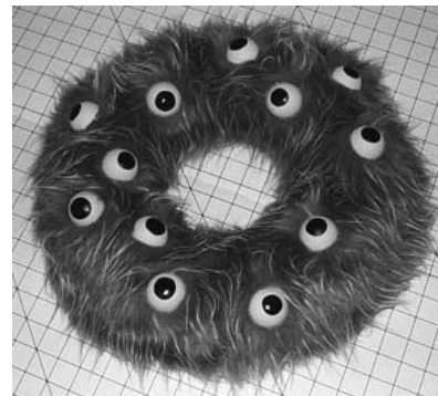
Completed wreath - ready to hang!

Begin by tracing two wreath shapes on the back of the fun fur and cut out. cut slits about 1 1/4 inches long where you want the eyes. Push a ping pong ball through the slit, then ring with glue. Glue the two layers of fur together and stuff with poly stuffing. Use glue to close the hole in the wreath. Sew a ribbon to the back for hanging. Use a black paint pen to draw eyes on the ping pong balls. You're done!