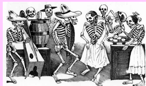
"Gran fandango y francachela de todas las Calaveras" - by Jose Guadalupe Posada, 1913

So, come and celebrate El Día de los Muertos with the Craft Mafia on Sunday, November 1st at the Ruby Room. The festivities run from 2 pm - 7 pm and include crafty vendors, a "Muertos" costume contest (come dressed in your best "dead" attire & maybe win a bar tab courtesy of the Ruby Room), a horror movie trivia game, and a DIY craft booth where you can decorate a Day of the Dead skull to take home. Also, enjoy a $3 Margarita on the Rocks, tequila shot, or special shot of the day - the Pink Posada! The Ruby Kitchen will be offering food specials too! Just ask any Mafia member for the password and you can get a free appetizer when you order any entrée! There's no cover charge and you must be 21+ to enter the bar area! The Ruby Room is located in Hillcrest at 1271 University Ave. 92103.