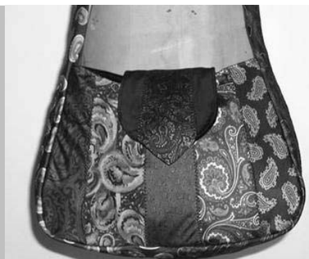
Messenger bag tutorial can be found on Craftster.org ( http://www.craftster.org/forum/index.php?topic=45985.0 )

even ideas on upholstering furniture with ties. Very colorful and definitely something that my dad would use! The messenger bag tutorial looks easy to follow, and who can't use another bag for craft stuff? I may have to try this one myself! In addition to the blog entries, check out the "Inspiration and Ideas" links. You will find a great collection of tutorials and ideas to get your creative energies going. Scroll down a bit more and you will also find links to sites that offer necktie items for sale with products ranging from apparel to pillows. Do some Father's Day shopping online!