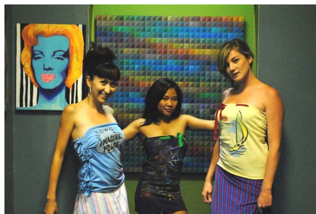
Tube tops by Meagan Rae Designs. Visit her online shop at: MeaganRaeDesigns.com

First, lay your t-shirt, inside-out, on a flat surface and cut the hem off the bottom of the shirt so you have a long skinny tube of fabric (set this aside to use later). Then, cut along each side of the shirt, just inside the armhole seam and cut straight across the top, just below the neckline, to create a rectangle shape. Now you want to pin the outer, longer sides of the shirt fabric together, making sure it is inside out, or that the right sides are together so that you can sew up the sides. Once you have sewn up the sides of the shirt, and all your pins are removed of course, turn the shirt right side out and essentially you have a tube! Almost done, the last step is to use your scissors and cut little snips all the way around the top of the tube about every 2-3 inches and about an inch from the top of the fabric. Grab that skinny piece of hem you cut from the shirt first and snip it so that it is a long string (rather than a tube!) and weave that string in and out thru the snip holes until the ends meet and can be tied into a bow, this makes your drawstring tube top fit snug and stay up!