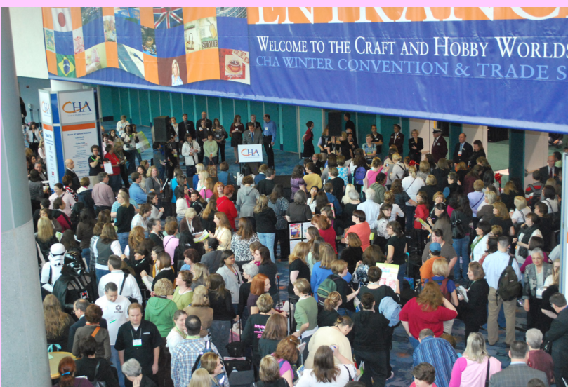
Crowds gather to get into the CHA 2009 Winter Show

The show usually starts on Sunday and ends mid Wednesday. It can be grueling, since there is SO much to see, I never thought that I would ever be tired of going to a local craft or fabric show, it's overwhelming. What's fun about the shows are the samples! We love getting those. This tradeshow is a little bit like Disneyland. You know how people go and buy funny hats or wear feather boas, etc, except people don't buy them, they are given away. This year, Cricut introduced a machine that will cut fondant designs for cake decorating, so they gave out free chef hats, http://www.cricut.com/shopping/ProductDetails.aspx?id=906&s=1&sc=1 . During the show, you would see groups of ladies and gentlemen wearing chef hats with the hope that they would win a free Cricut machine.