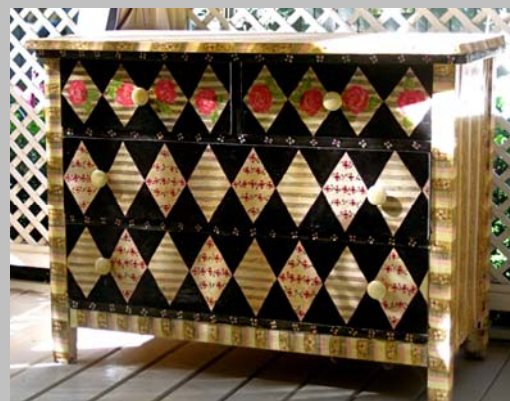
Hand painted recycled furniture and pillows found at: http://priscillamaeetal.blogspot.com

Dear Martha-on-a-budget: An easy and fairly inexpensive way to freshen up or change the look of any room is new paint! A couple gallons of paint won't put you back too much, if you're willing to take the time to prep and do the work. If you're not up for a whole room, pick one wall and go for it. Use masking tape to create borders for picture frames, or interesting designs with the old paint peeking through. New wall art can also be an inexpensive way to change things up. You can whip up yourself a handmade collage using old greeting cards, pretty pictures from magazines, leaves and dried flowers, and put behind and inexpensive poster frame. Another fun thing