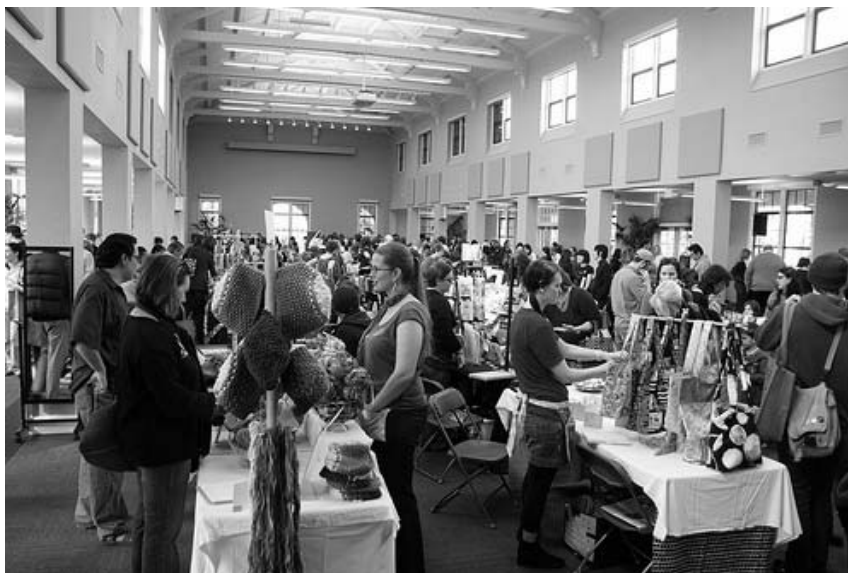
The 2nd Annual Holiday Hit List. December, 2008.

This year we will be celebrating our 2nd Anniversary at the Ruby Room on August 30th, 2009 from 2pm-8pm. The Ruby Room is one of our local favorite venues that supports the art community of San Diego. They invited us to have our event at their newly expanded location. Did you know that the Ruby Room now has recently opened the Ruby Kitchen adjacent to the Ruby Room? Not only is their bar a great place to get drinks and see a variety of musical acts and events, but now you are just a few steps away from a place to get good food too!